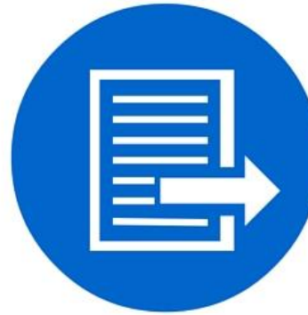
Clinical Documentation Improvement Specialist