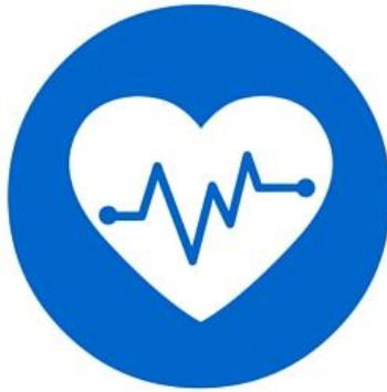
Hospital Coder/ Coding Professional